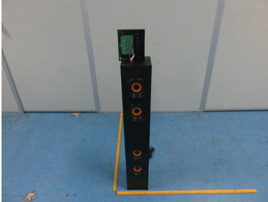
The EUT-Inside View