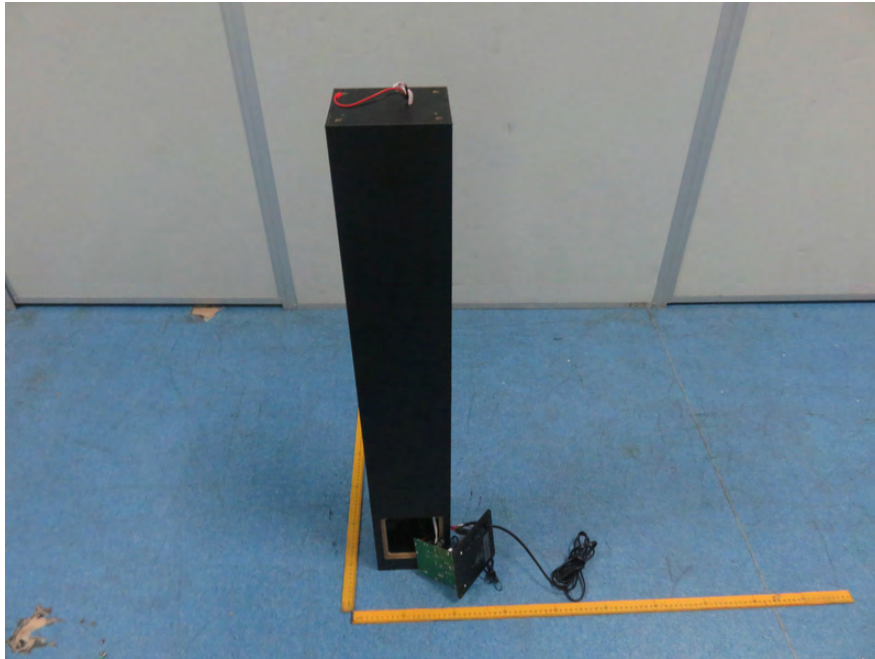
The EUT-Inside View