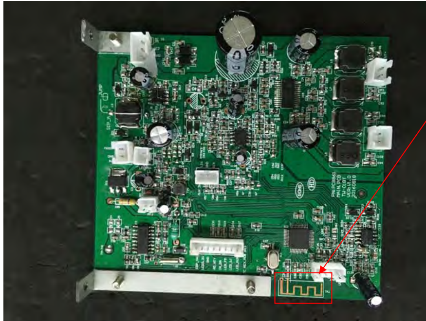
PCB of the EUT-Front View