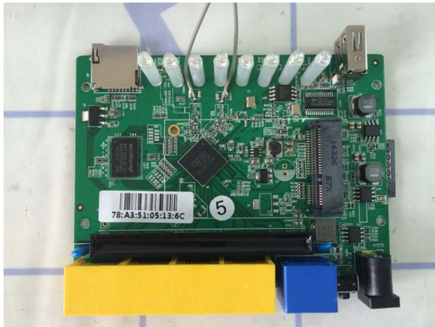
PCB view side 1

Copyright of this report is owned by Centre of Testing Service and may not be reproduced other than in full except with the written approval of the issuing Company.