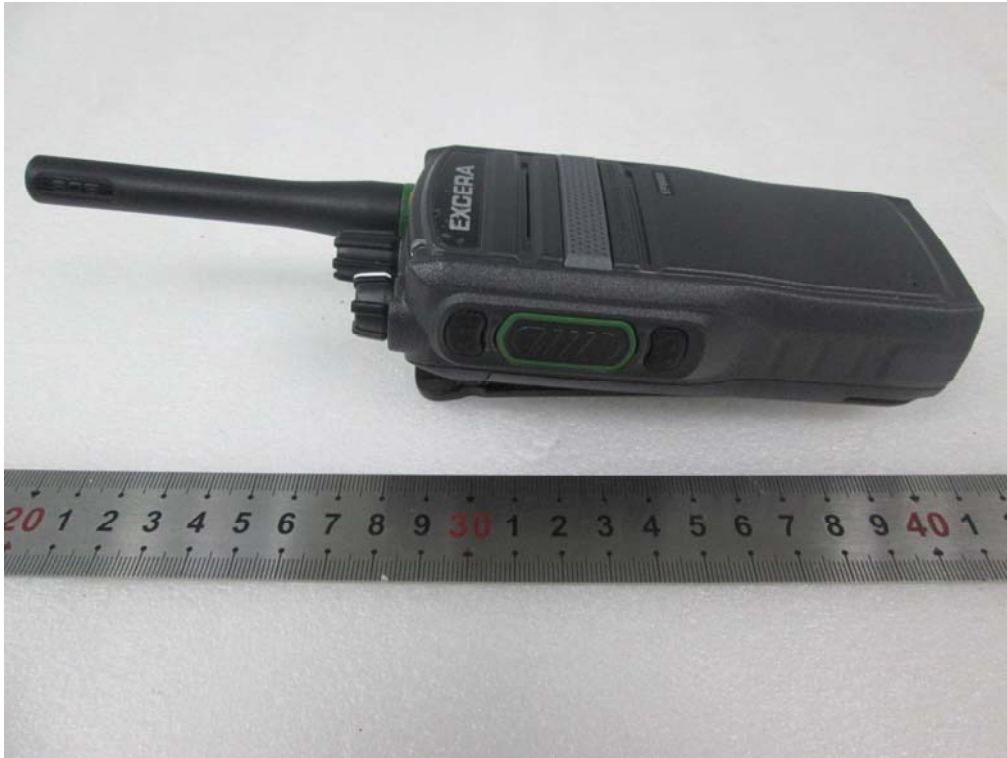
EUT-Right View (EP8000 U2)