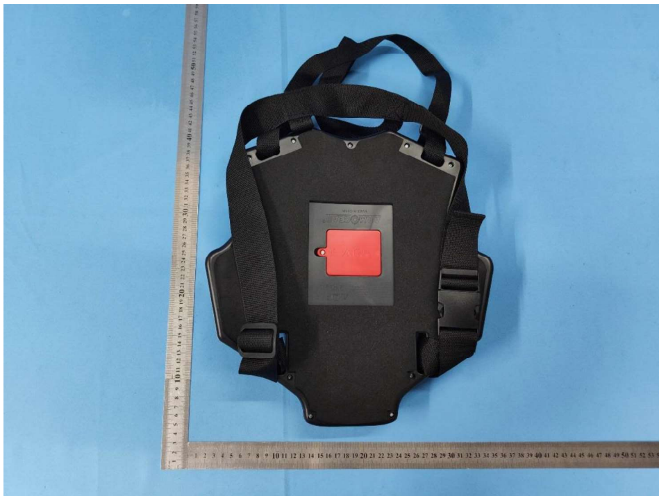
External View (Model: 370410508)