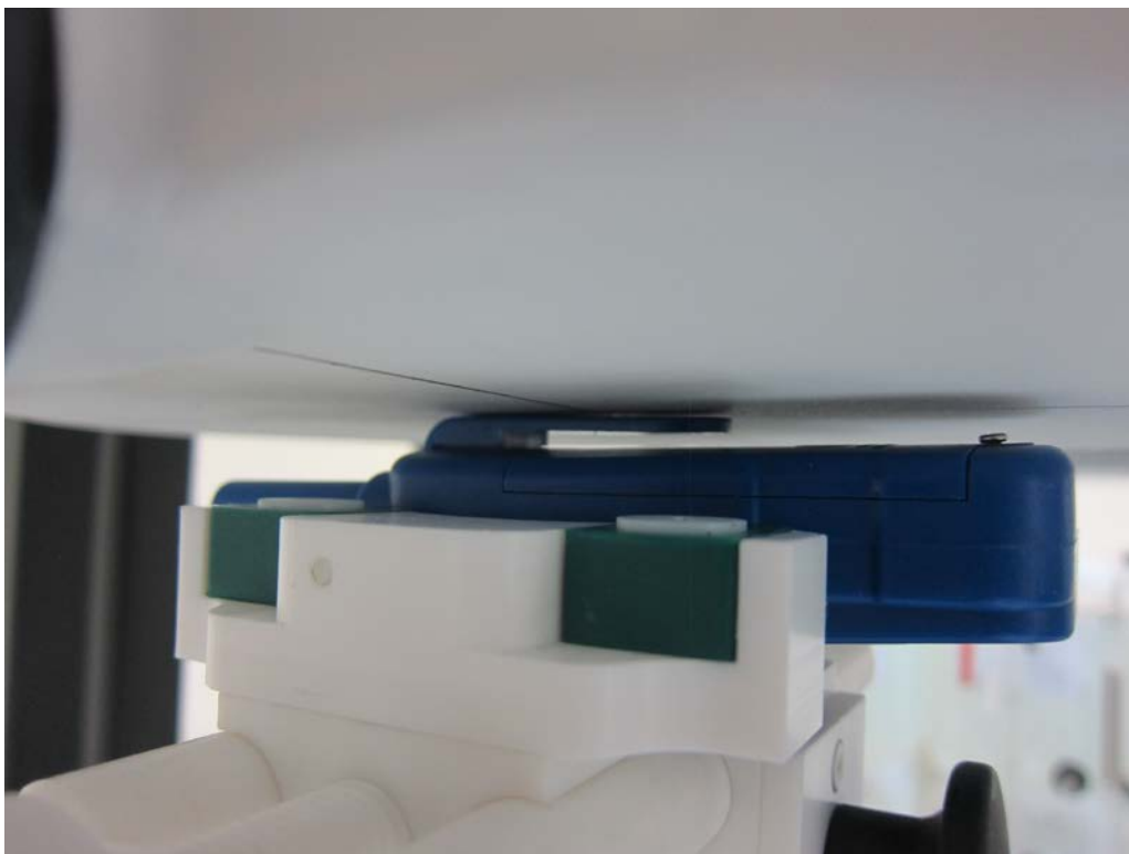
Figure 2 – Back surface with 0mm Separation