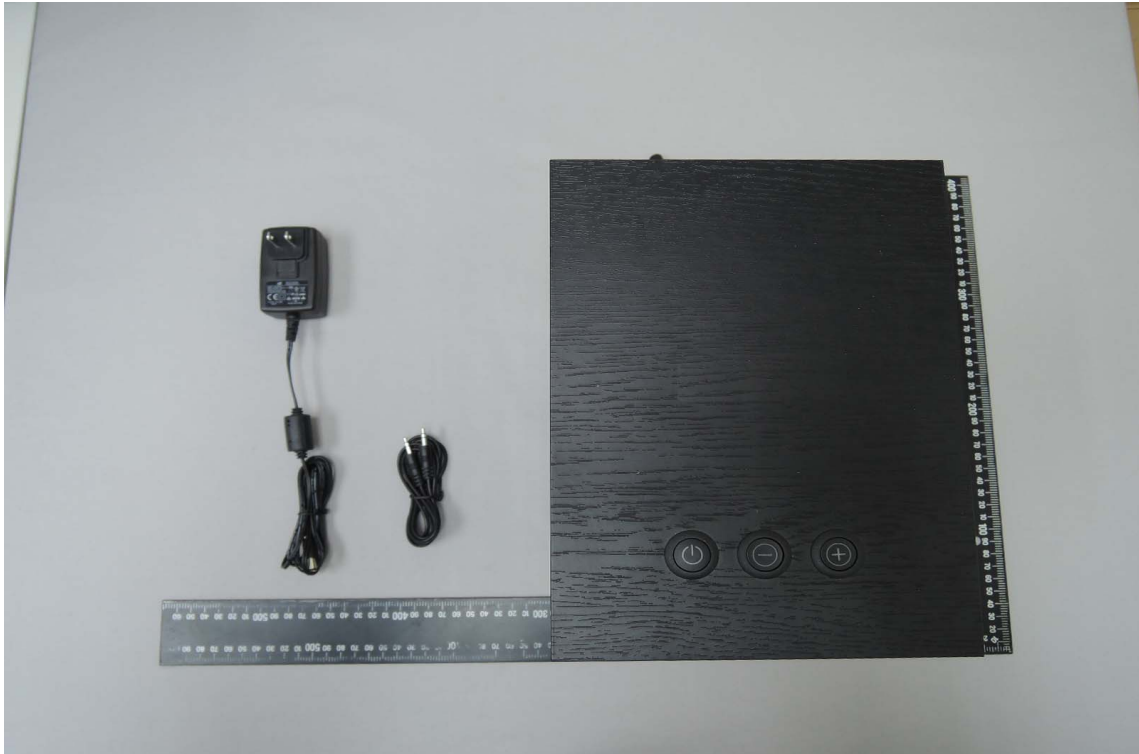
Front View of EUT-1