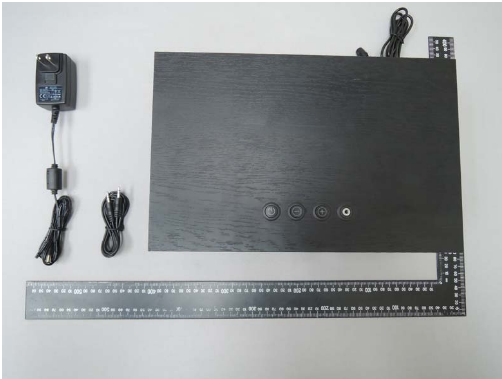
Front View of EUT-1