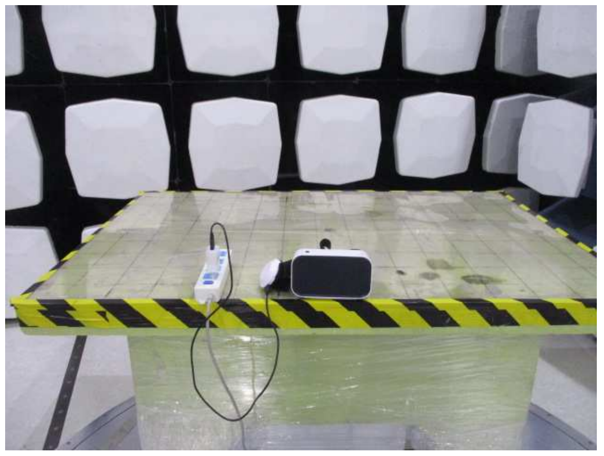
Up to 1GHz