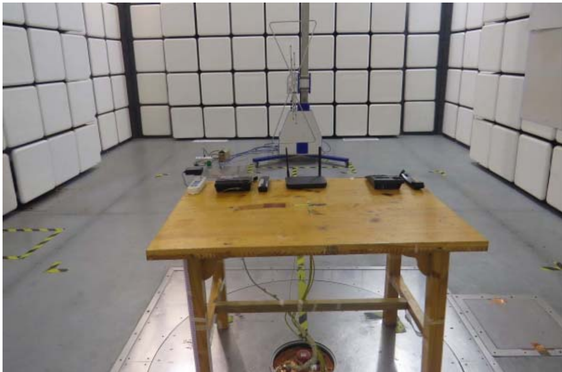
a: Below 1GHz