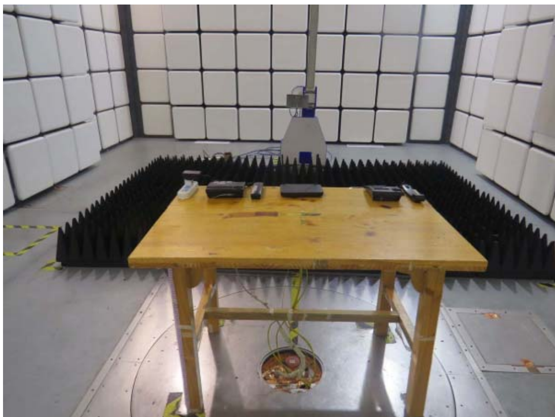
b: Above 1GHz