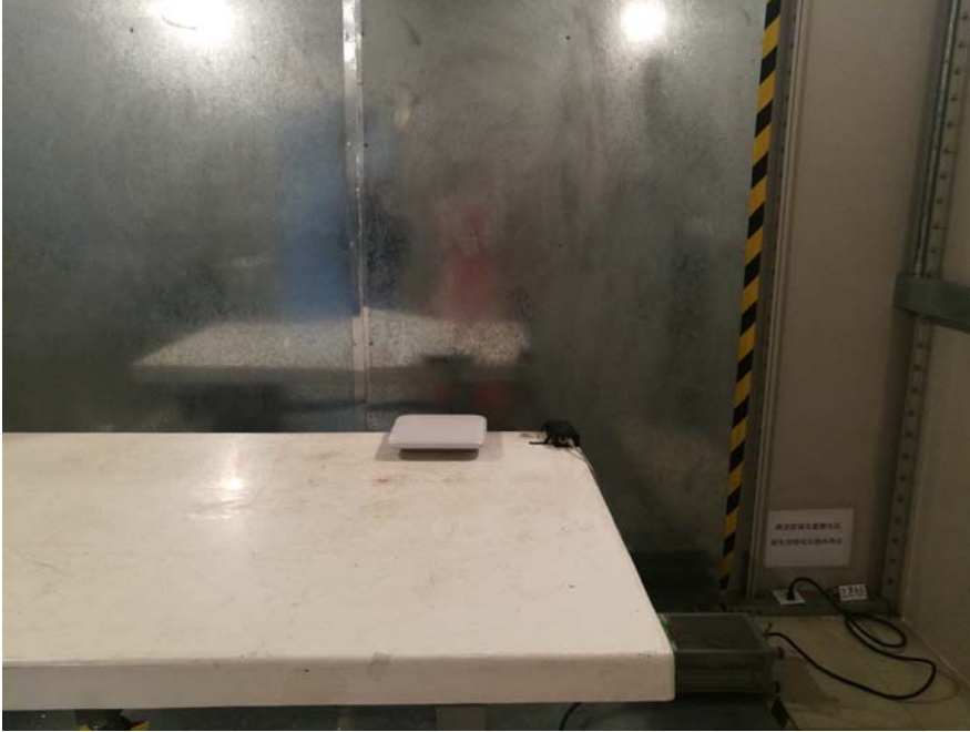
Conducted Emissions (Side View)