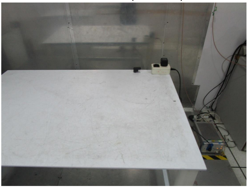
Radiated Emissions which fall in the restricted bands & Radiated Spurious Emissions

Conducted Emissions at AC Power Line (150kHz-30MHz)