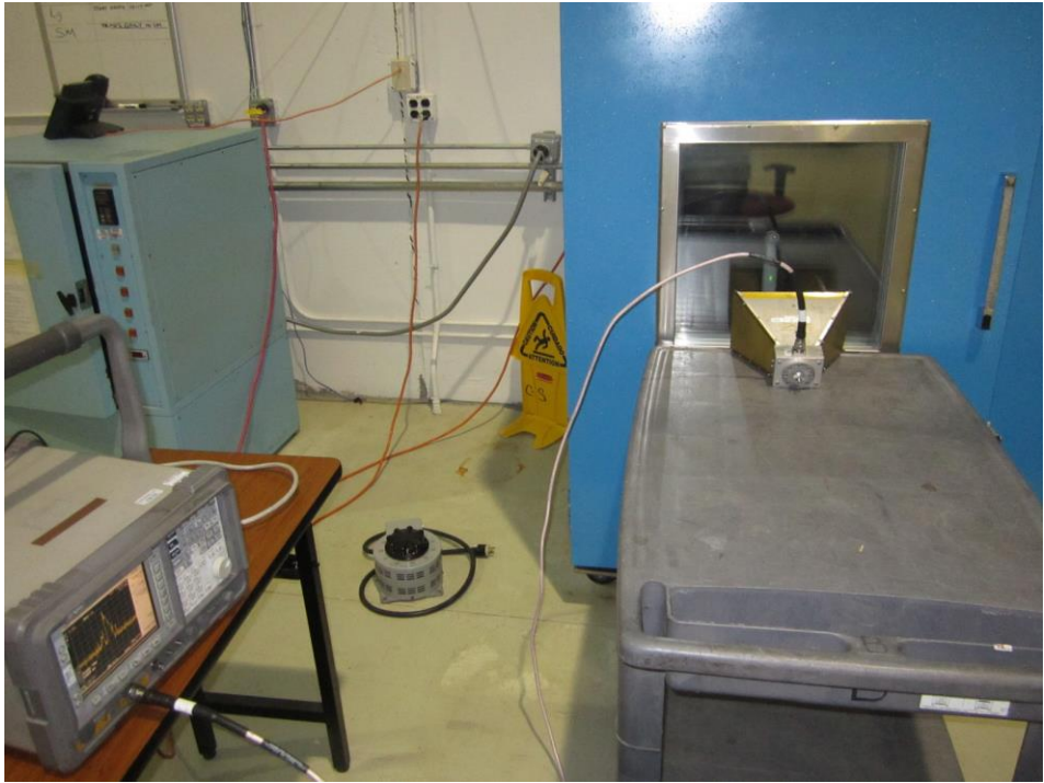
Environmental testing – Overview Set Up