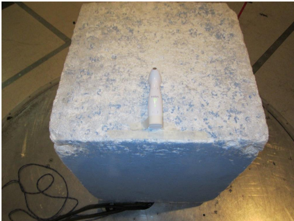
X - Orientation