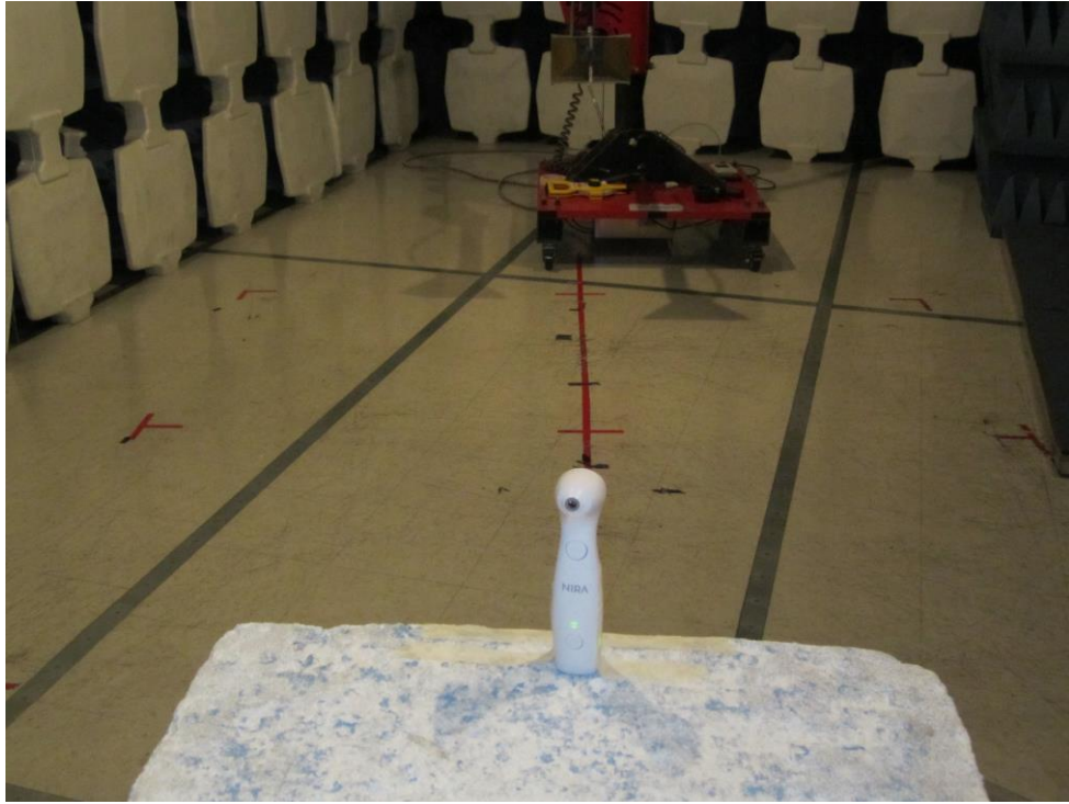
EMI Radiated – Front (High Range)