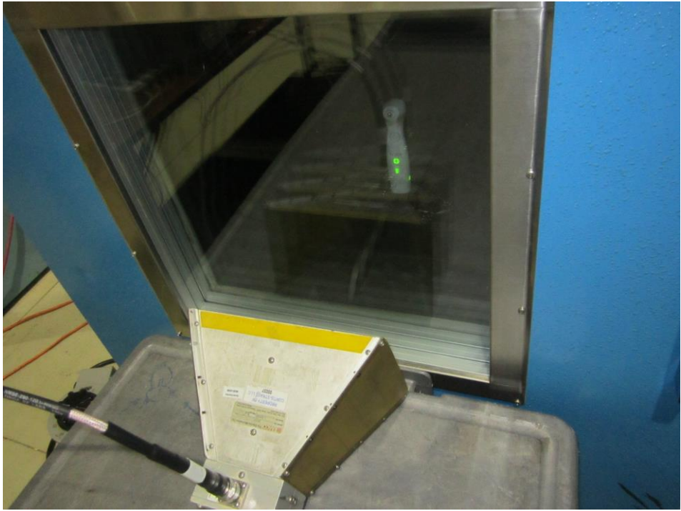
Closed up View