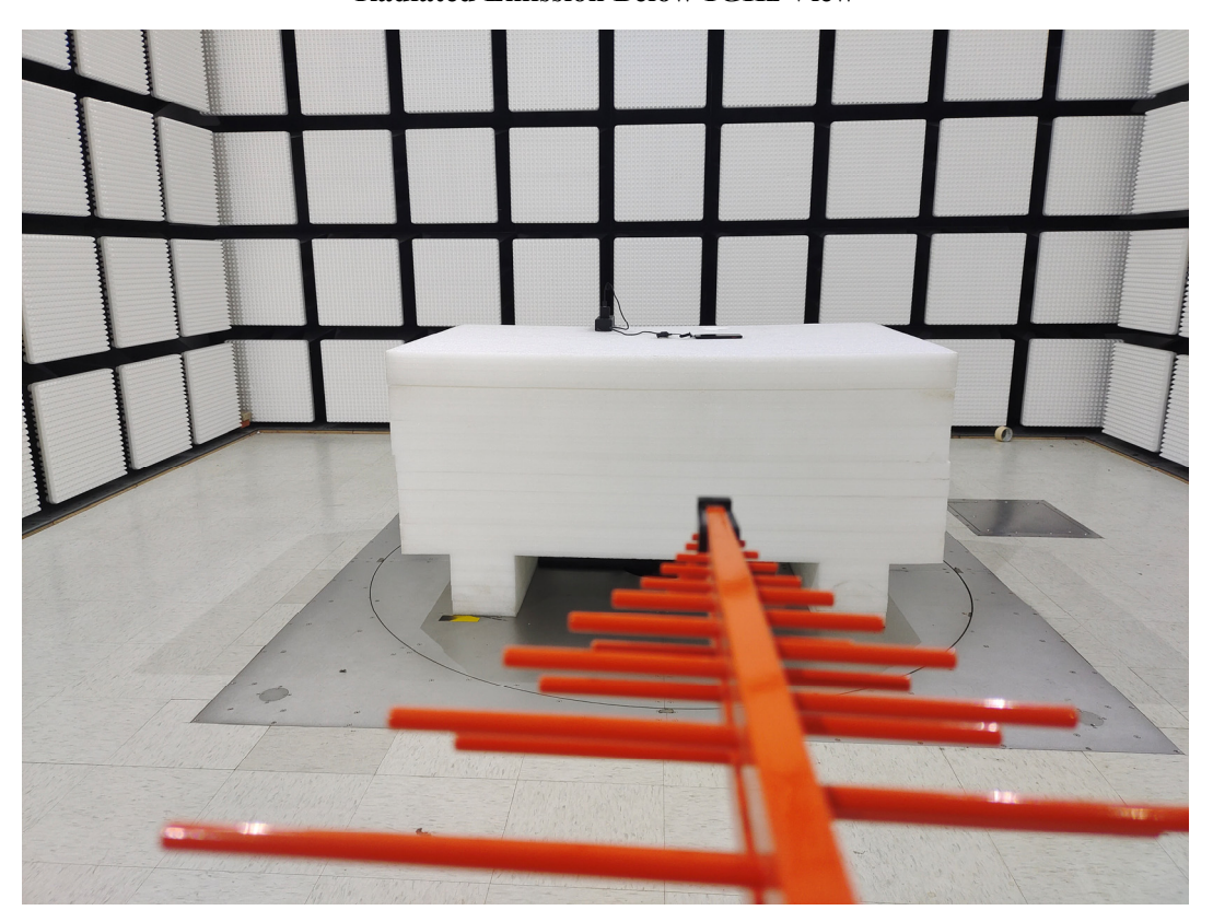
Radiated Emission Above 1GHz View