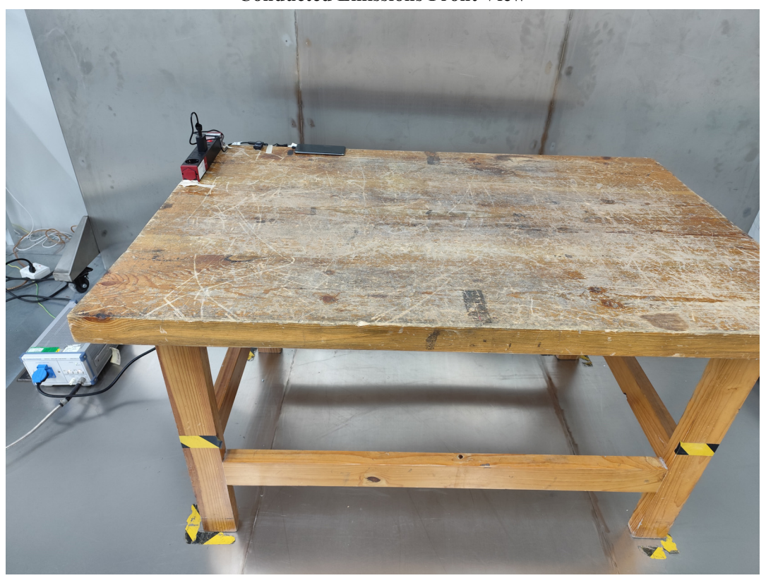
Conducted Emissions Side View