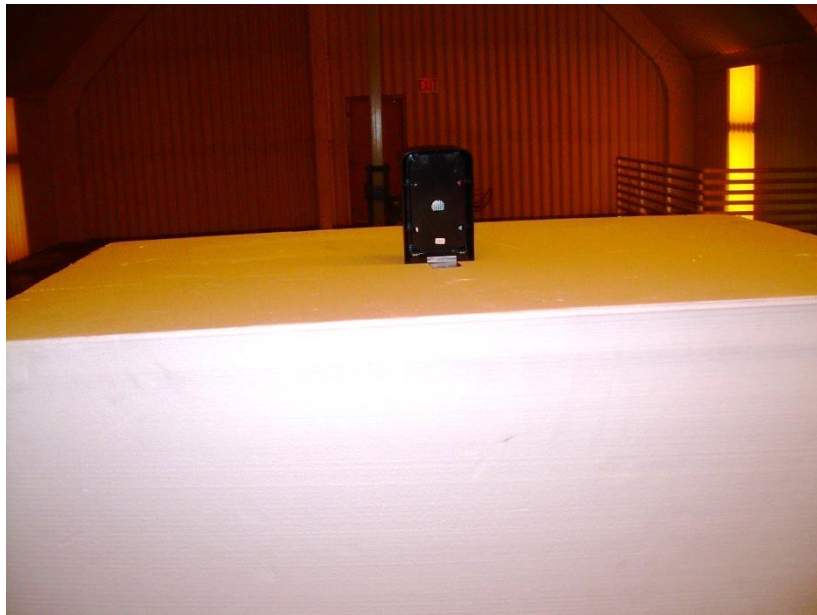
Photograph 4: Back View Radiated Emissions Worst-Case Configuration – Emissions Above 1000 MHz