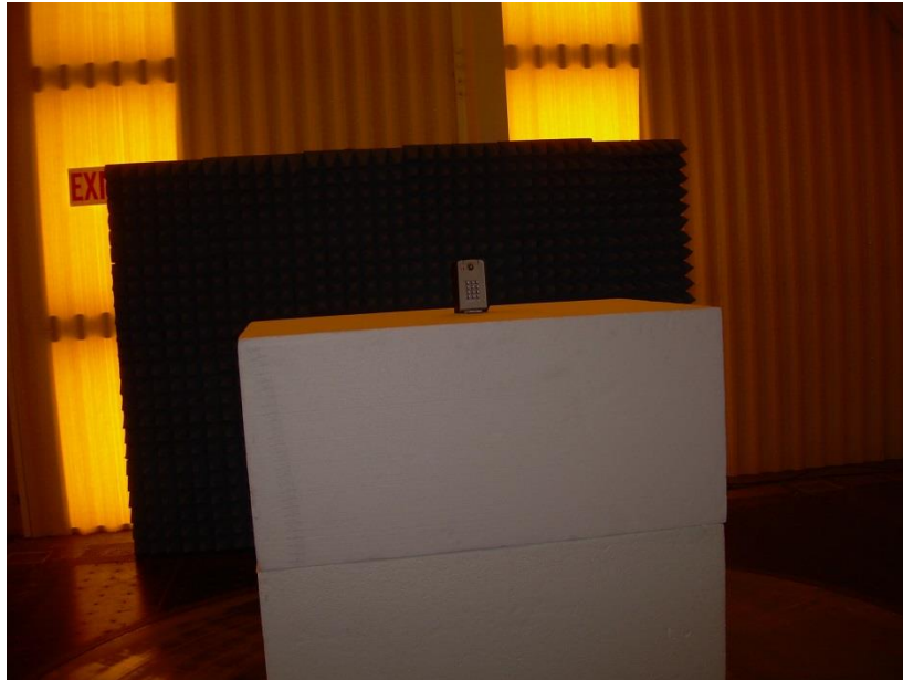
Photograph 3: Front View Radiated Emissions Worst-Case Configuration – Emissions Above 1000 MHz