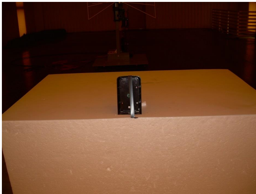
Photograph 2: Back View Radiated Emissions 30 MHz to 1000 MHz