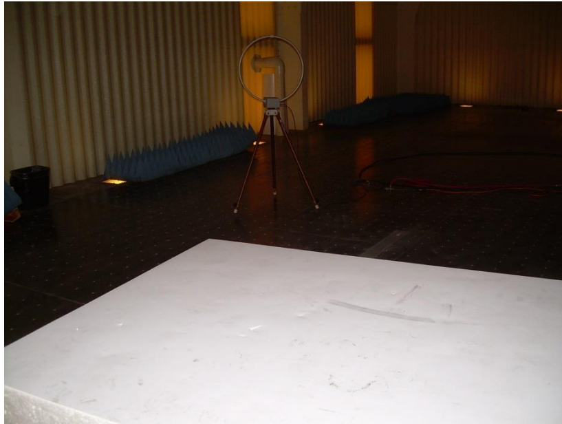
Photograph 5: Test Setup for Emissions Below 30 MHz