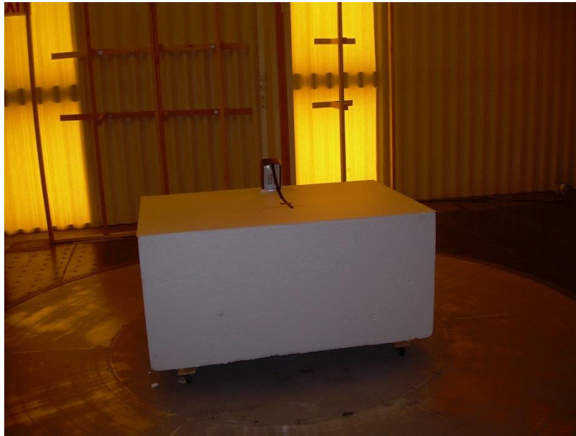
Photograph 1: Front View Radiated Emissions Below 1000 MHz