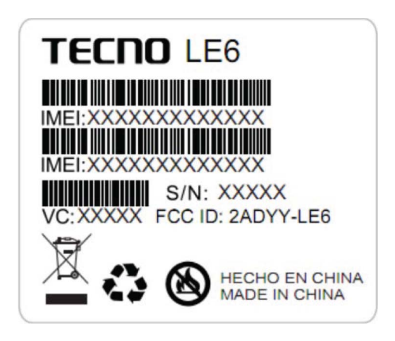
FCC ID Label Location Information