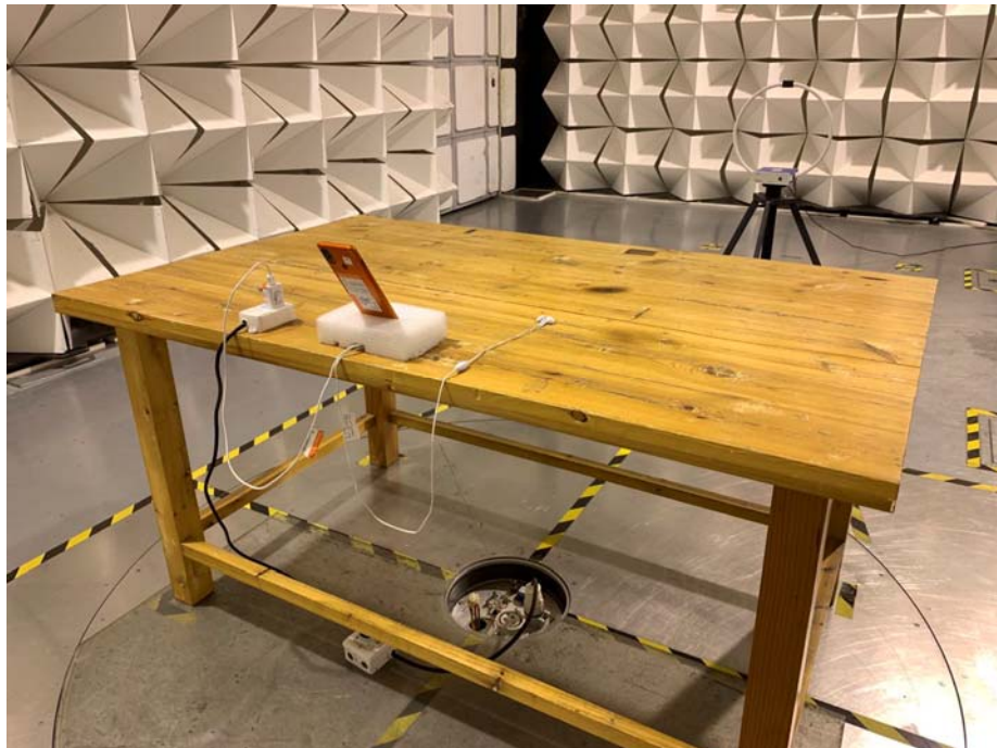
Below 30MHz Test Site 2#