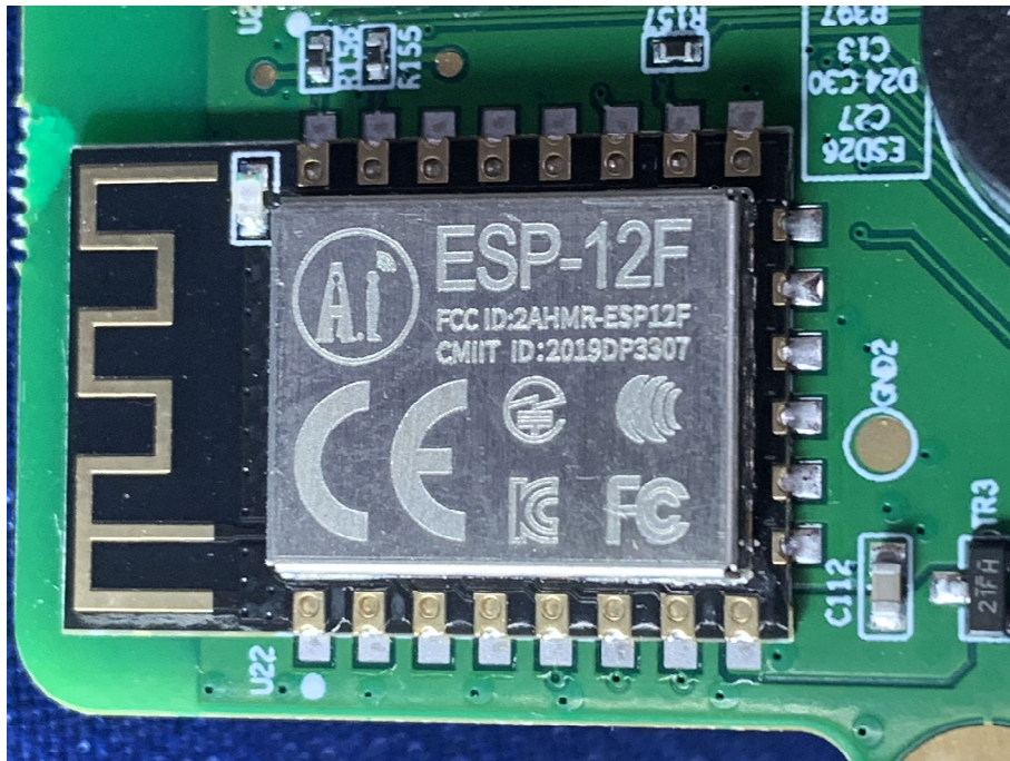
View of Product-17