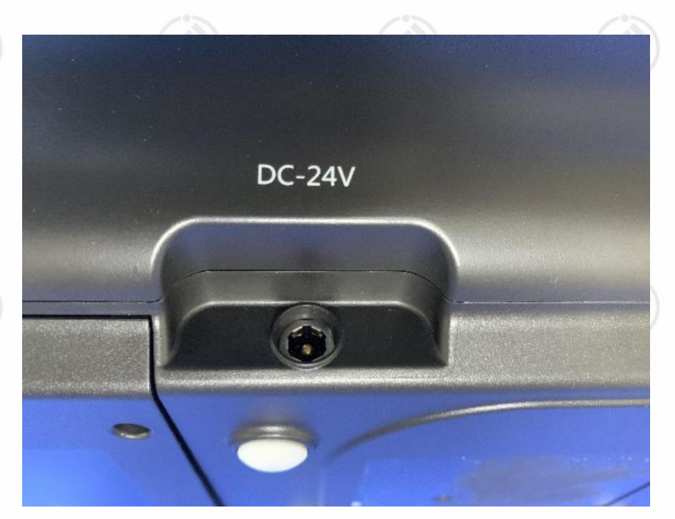
View of Product-8