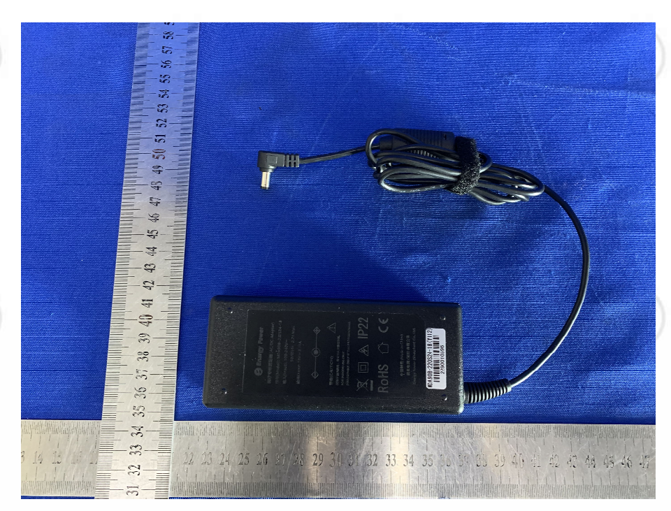
View of Product-9

Report No.: EED32O81096001 Page 42 of 47