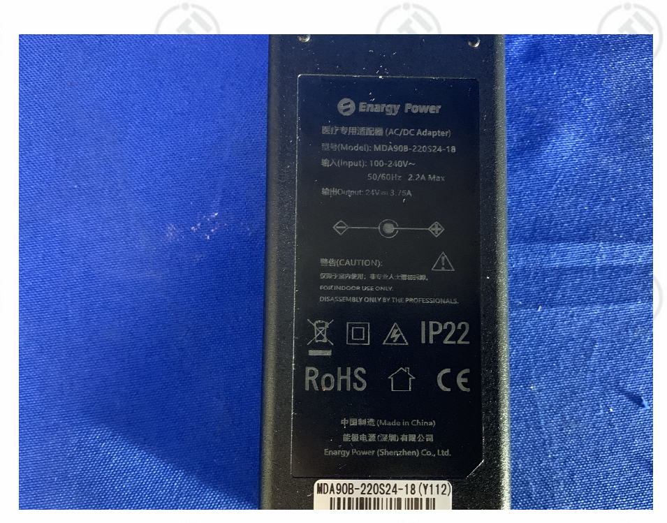
View of Product-10