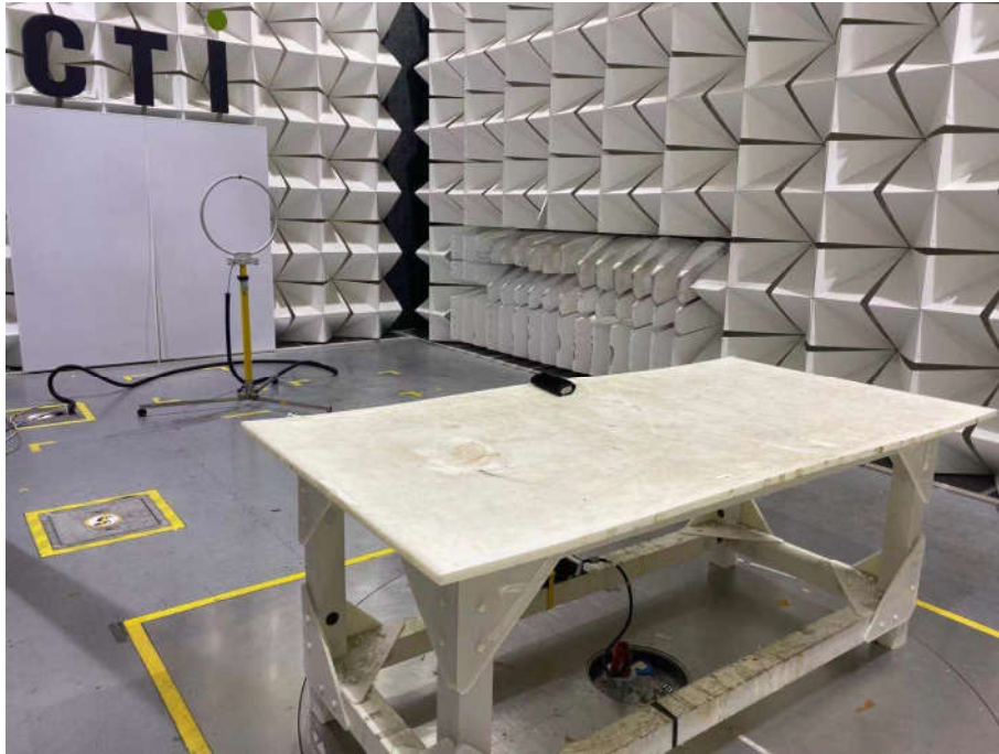
Radiated spurious emission Test Setup-1(Below 30M)