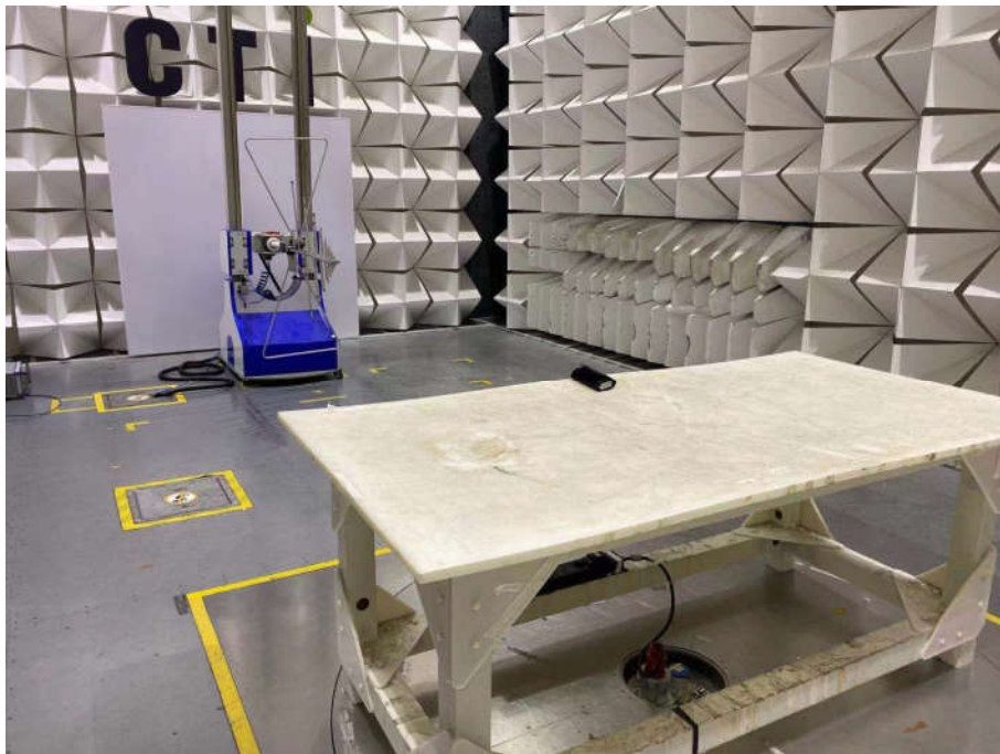
Radiated spurious emission Test Setup-2(Below 1GHz)