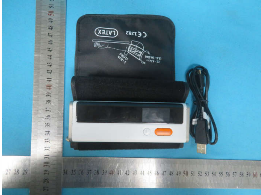
View of Product-0