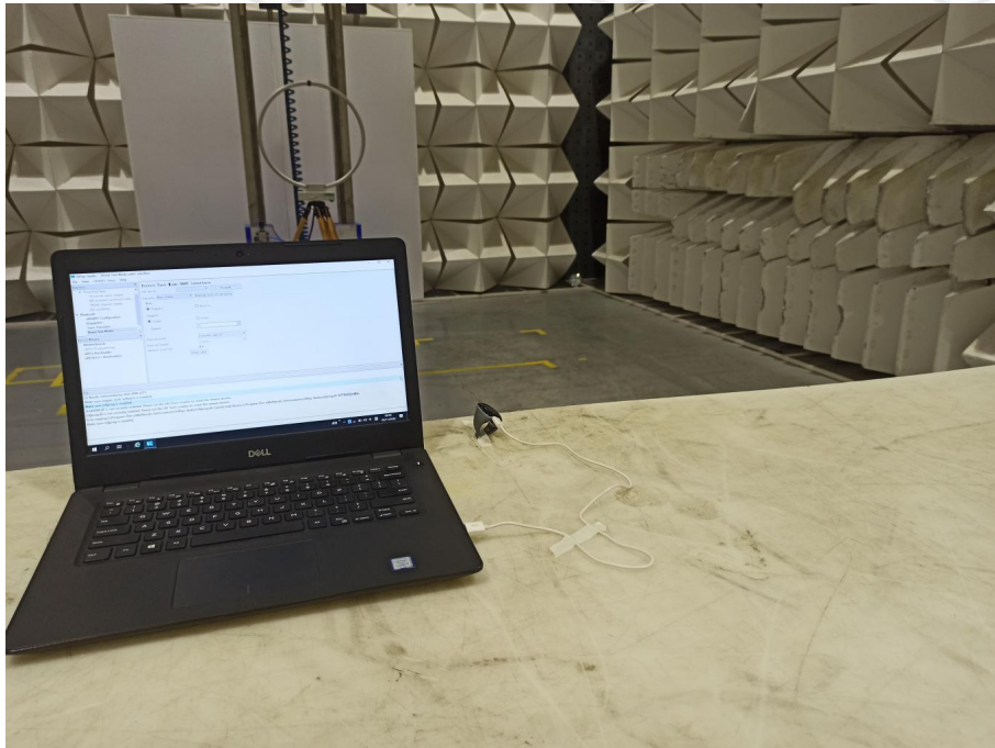
Radiated spurious emission Test Setup-1(Below 30MHz)