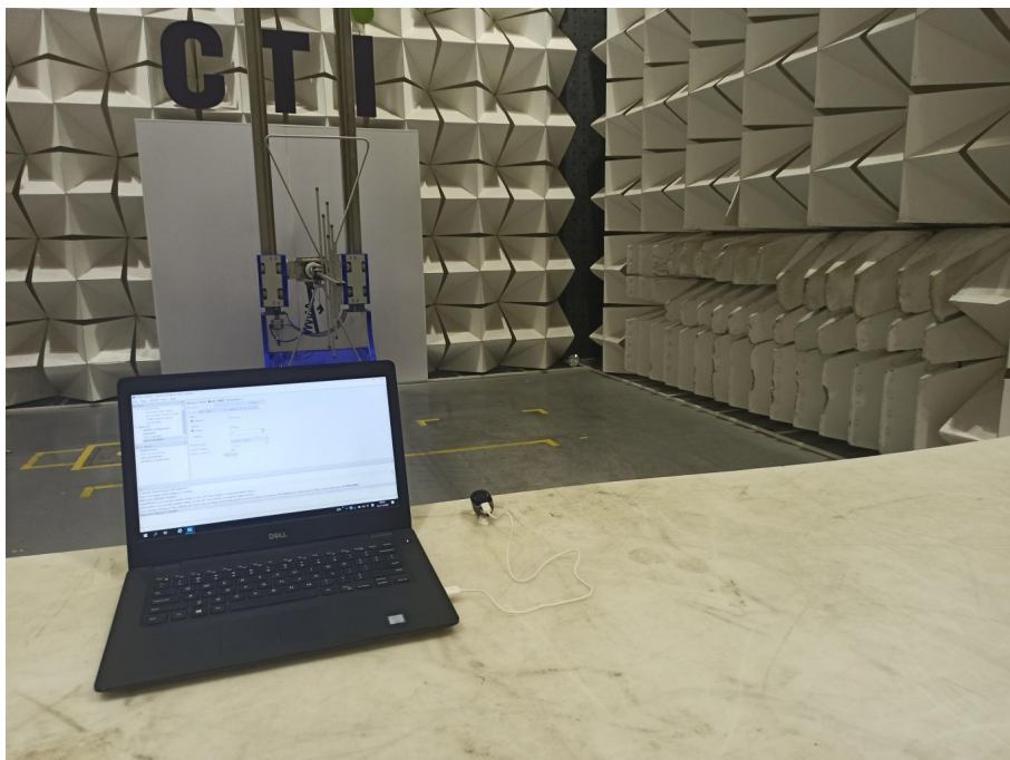
Radiated spurious emission Test Setup-2(Below 1GHz)