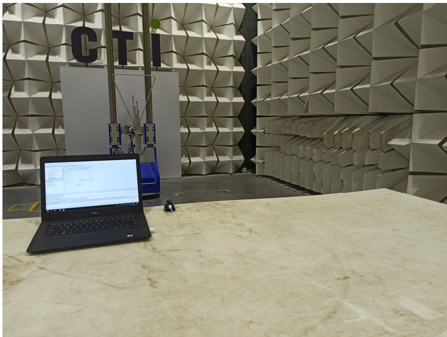
Radiated spurious emission Test Setup-1(Below 1GHz)