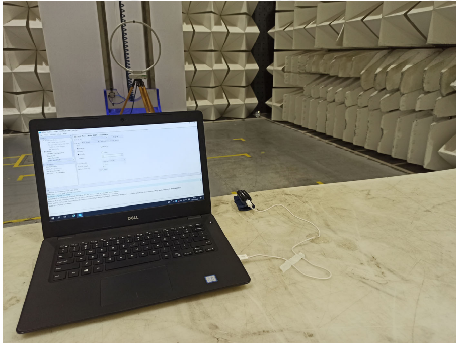
Radiated spurious emission Test Setup-2(Below 30MHz)