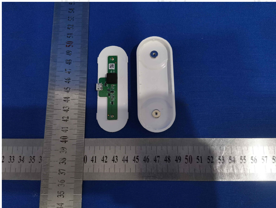
View of Product-10