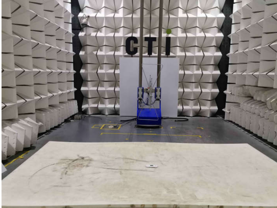
Radiated spurious emission Test Setup-1(Below 1GHz)