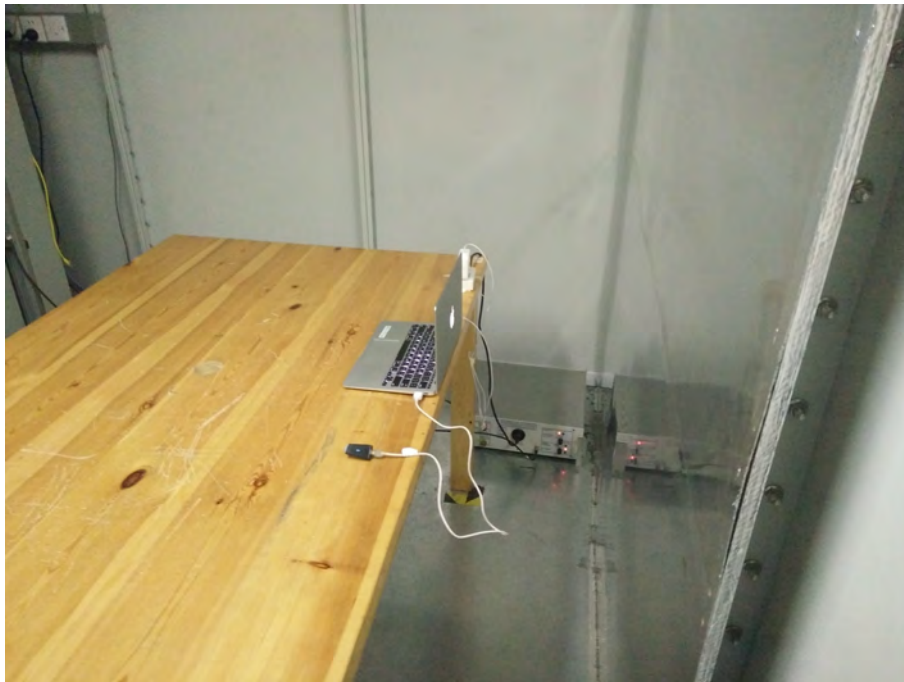
Conducted Emission Test 1