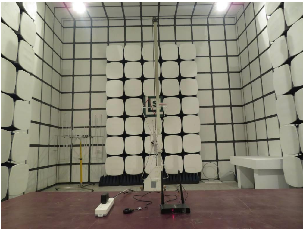
RE below 1GHz