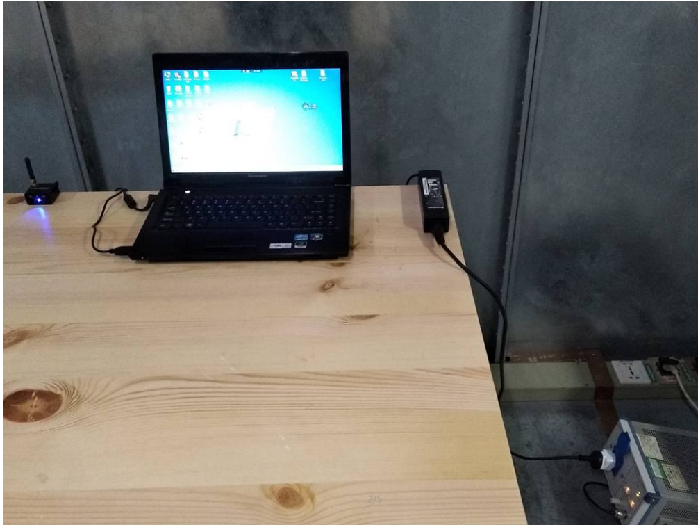
Conducted Emission-PC mode