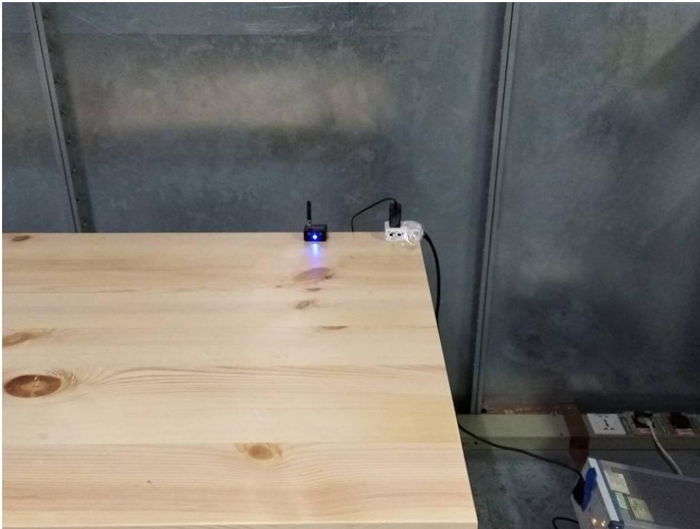
Conducted Emission-adapter mode