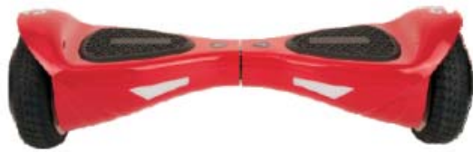
Two Wheels Balancing E-scooter Drifting Board