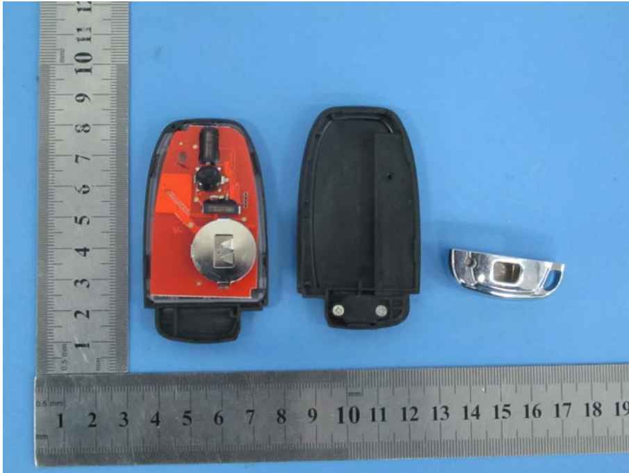
Photo 6 Internal of EUT