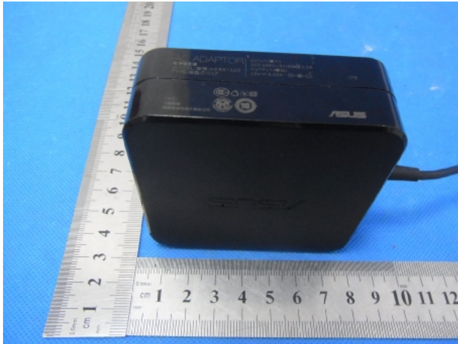
Lab provides adapter