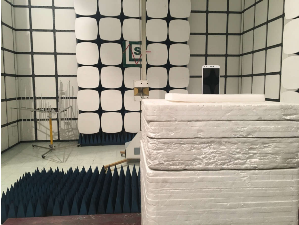
Spurious Emission above 1GHz