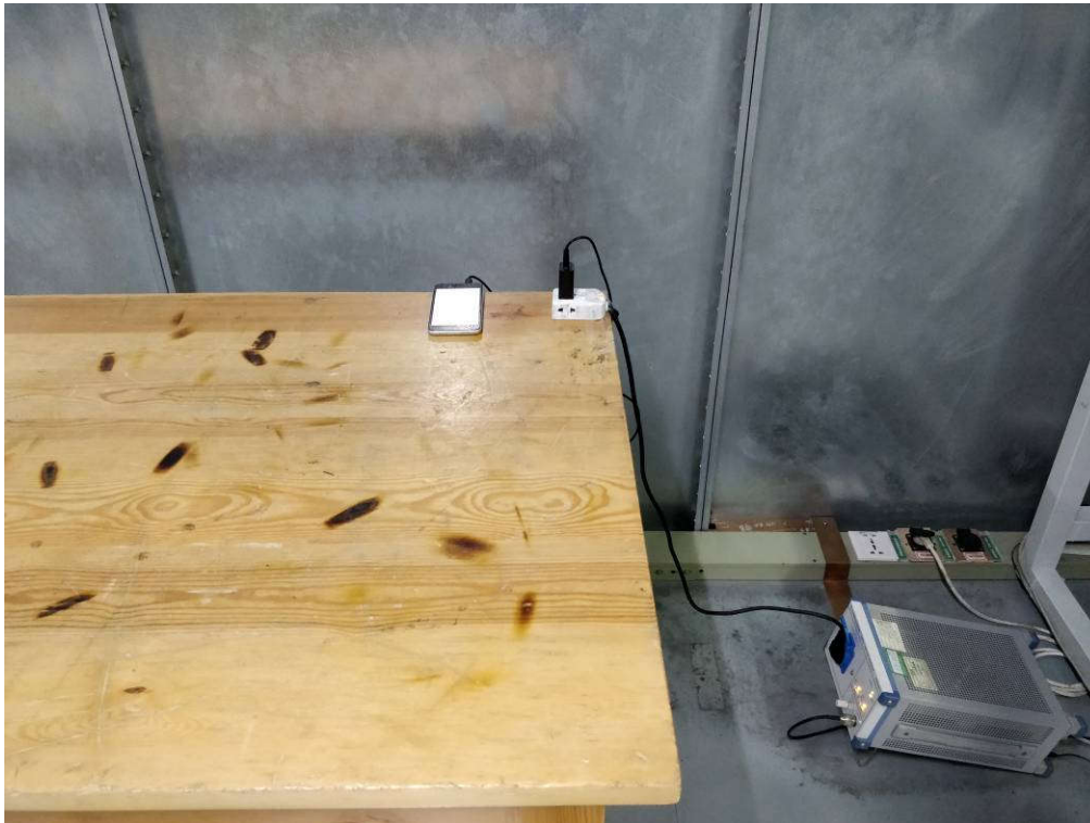
AC Conducted Emission of charge from power adapter mode