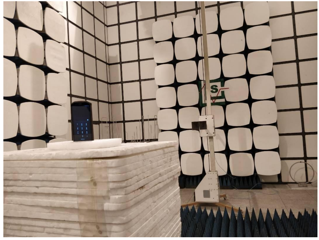
Fig. 2 (Above 1GHz)