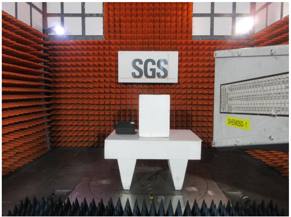
The EUT Details of Zoom