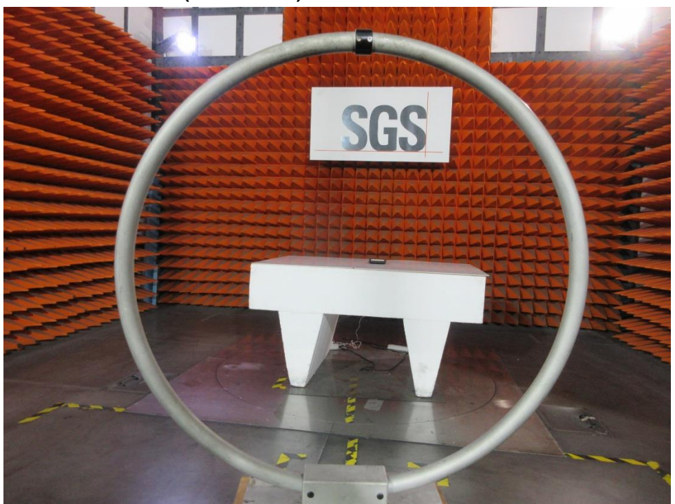
For 2.4GHz WiFi: Conducted Emissions at AC Power Line (150kHz-30MHz)