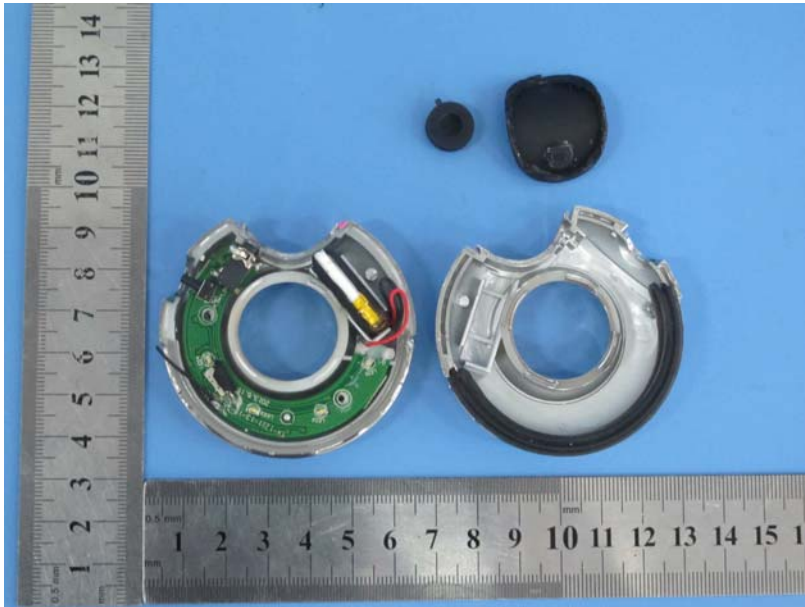
Photo 6 Appearance of PCB