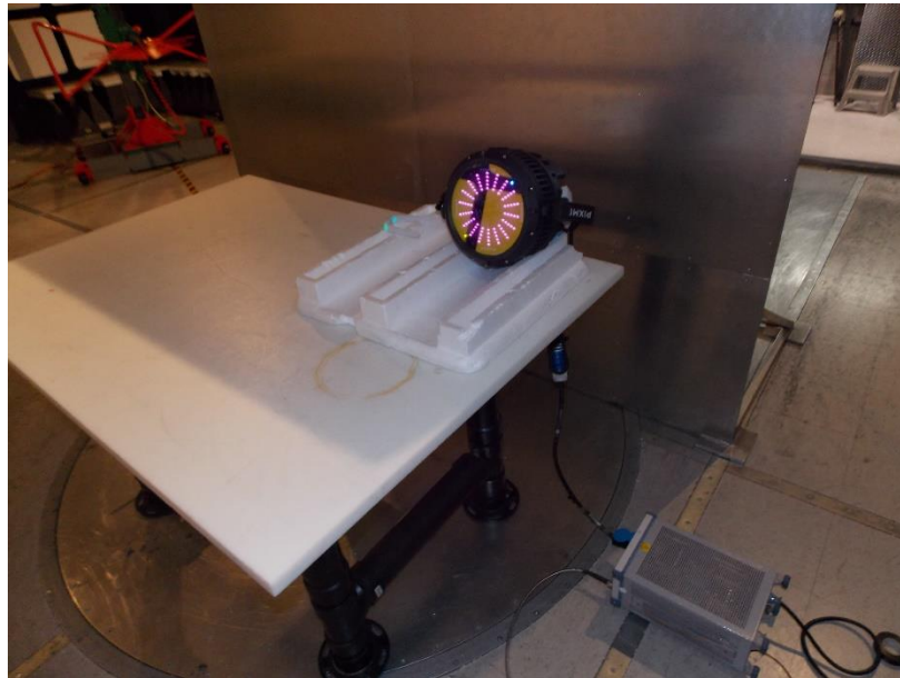
Figure 1.1-3: Conducted emissions – from AC mains power ports setup photo