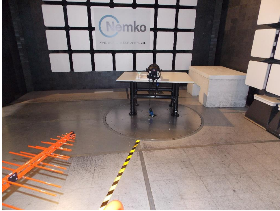
Figure 1.1-1: Radiated emissions setup photo – below 1 GHz