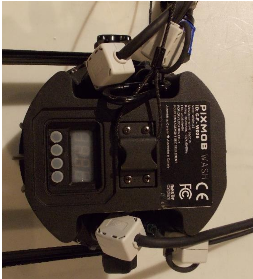
Figure 1.1-1: Modification view photo