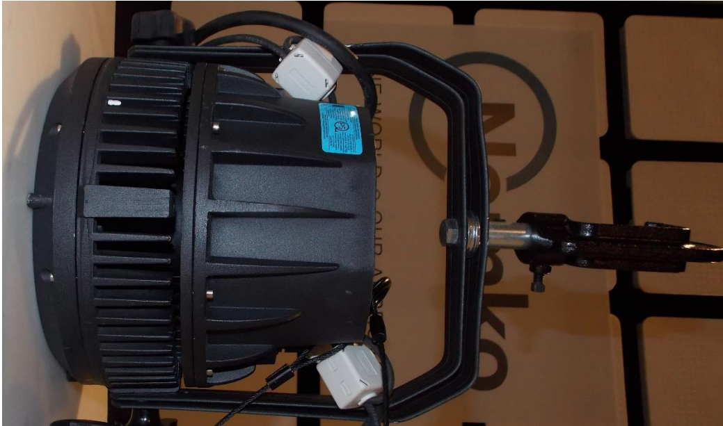
Figure 1.1-8: Bottom view photo