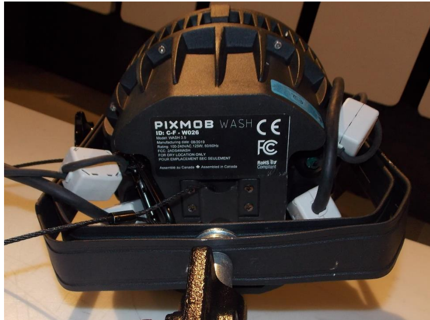
Figure 1.1-4: Rear view photo