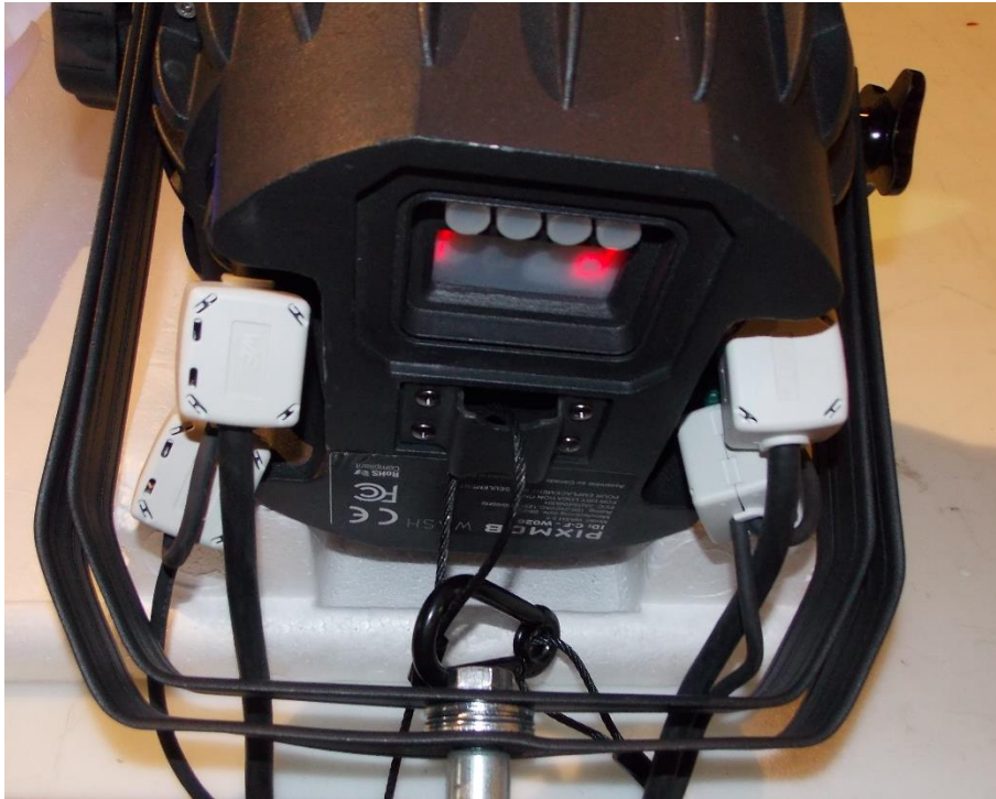
Figure 1.1-2: Modification view photo