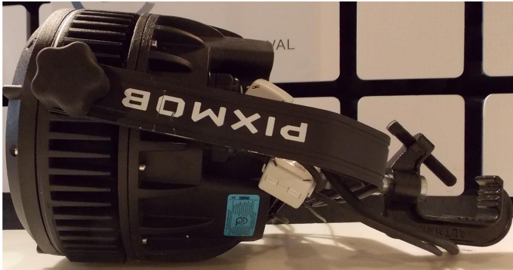
Figure 1.1-6: Side view photo