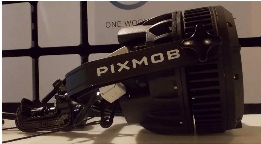
Figure 1.1-5: Side view photo