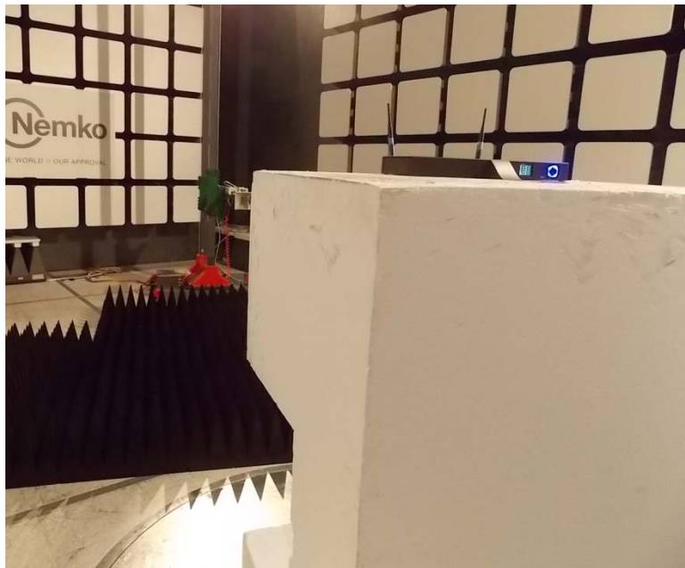
Radiated spurious (out-of-band) emissions setup photo – above 1 GHz