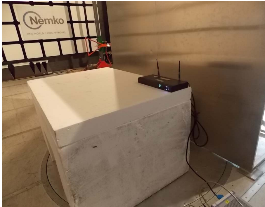
AC power line conducted emissions limits setup photo