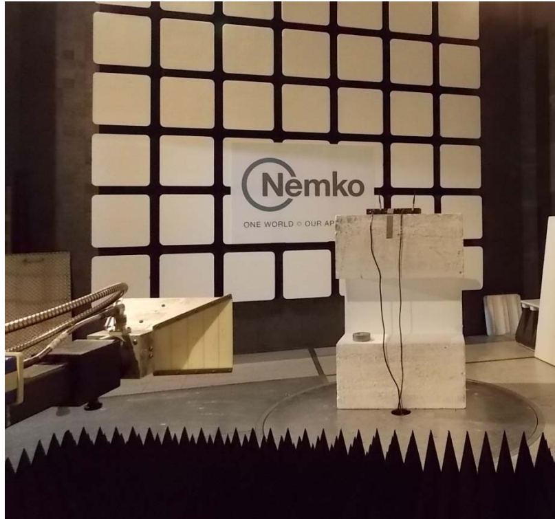
Radiated spurious (out-of-band) emissions setup photo – above 1 GHz