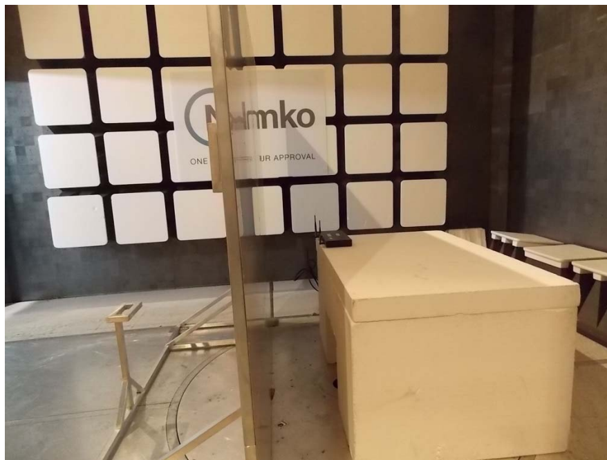
AC power line conducted emissions limits setup photo