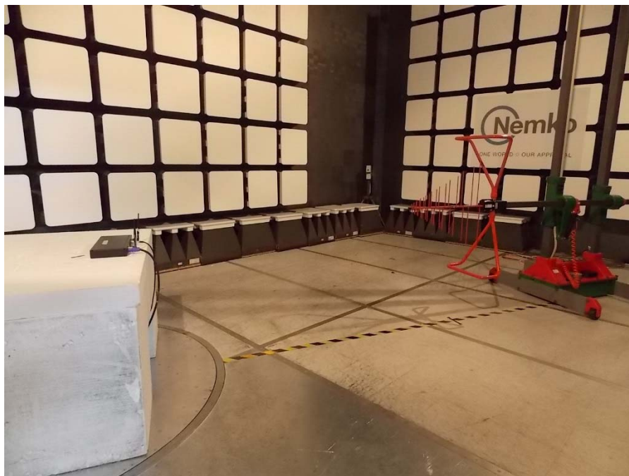
Radiated spurious (out-of-band) emissions setup photo – 30 to 1000 MHz