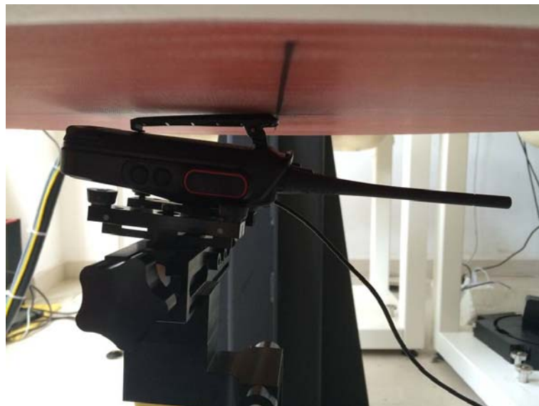
Body-worn, the front of the EUT towards ground with A1, B1, BC1 and AC1 (The distance was 0mm)