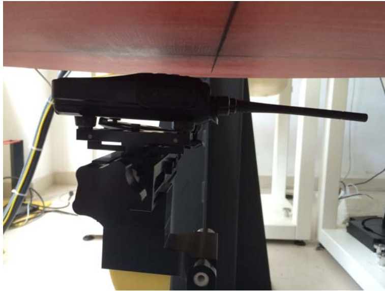
Face-held, the front of the EUT towards phantom (The distance was 25mm)