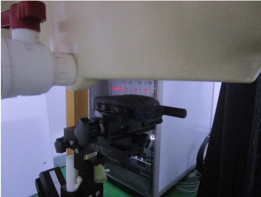
Body Back Setup Photo (0mm)