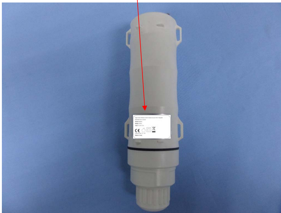
FCC ID Label Location