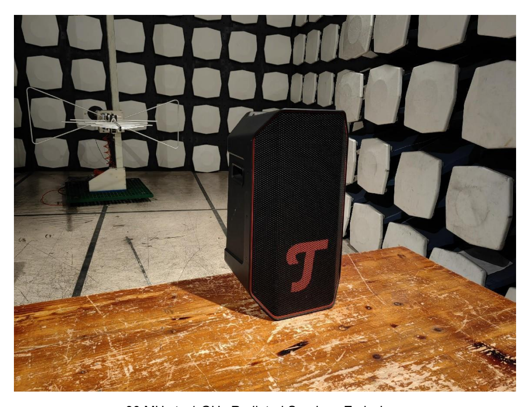
30 MHz to 1 GHz Radiated Spurious Emissions