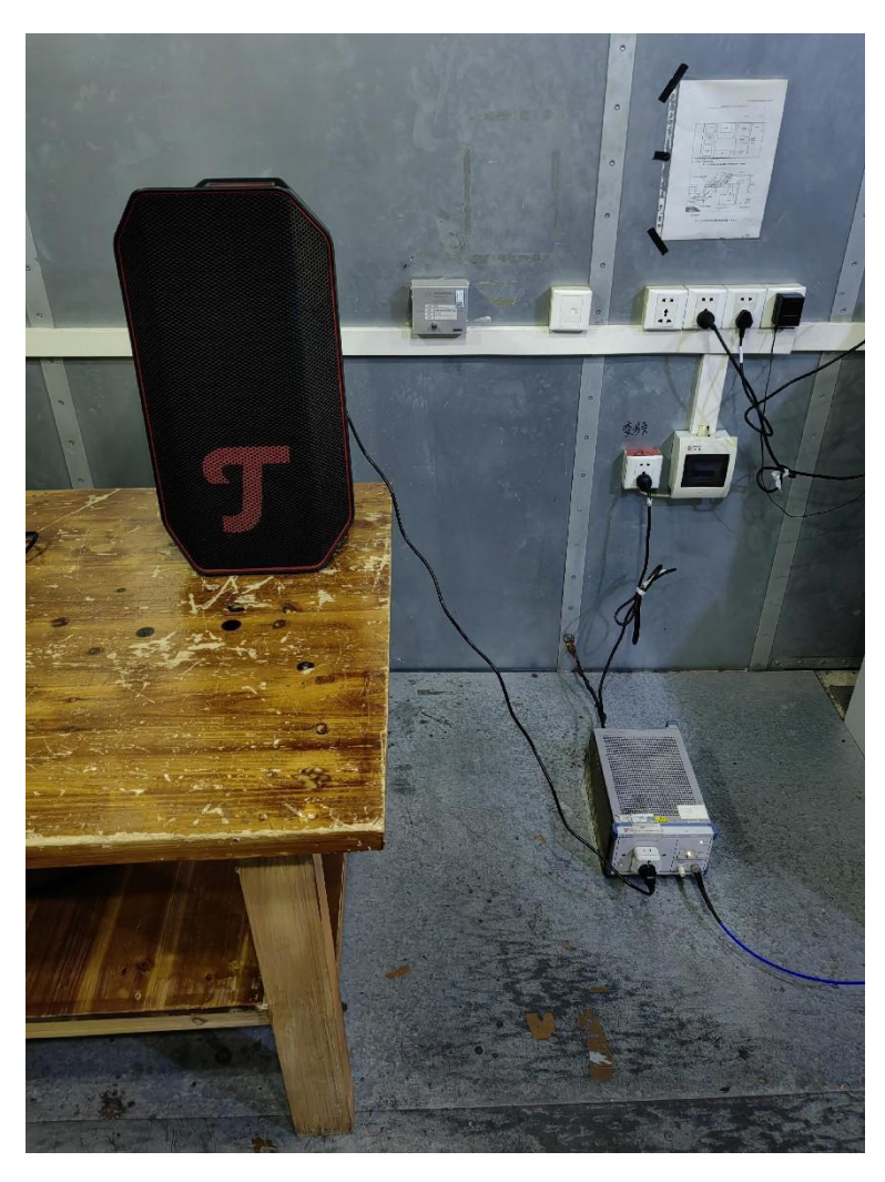
Conducted Emissions at Mains Terminals 150 kHz to 30 MHz