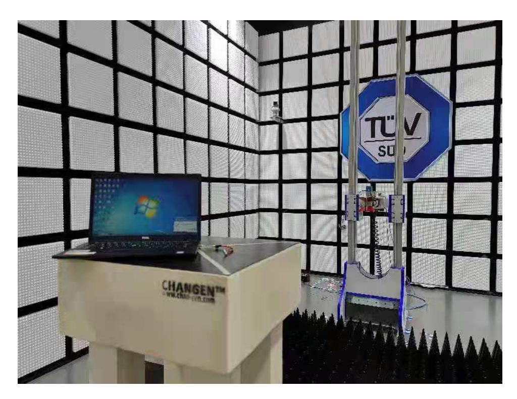
Spurious radiated emissions 1G to 18G