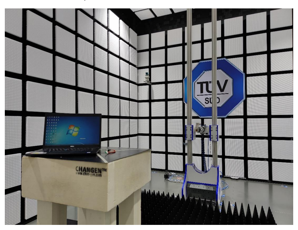
Spurious radiated emissions Above 18G