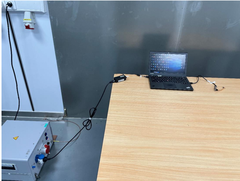
AC Conducted emission test