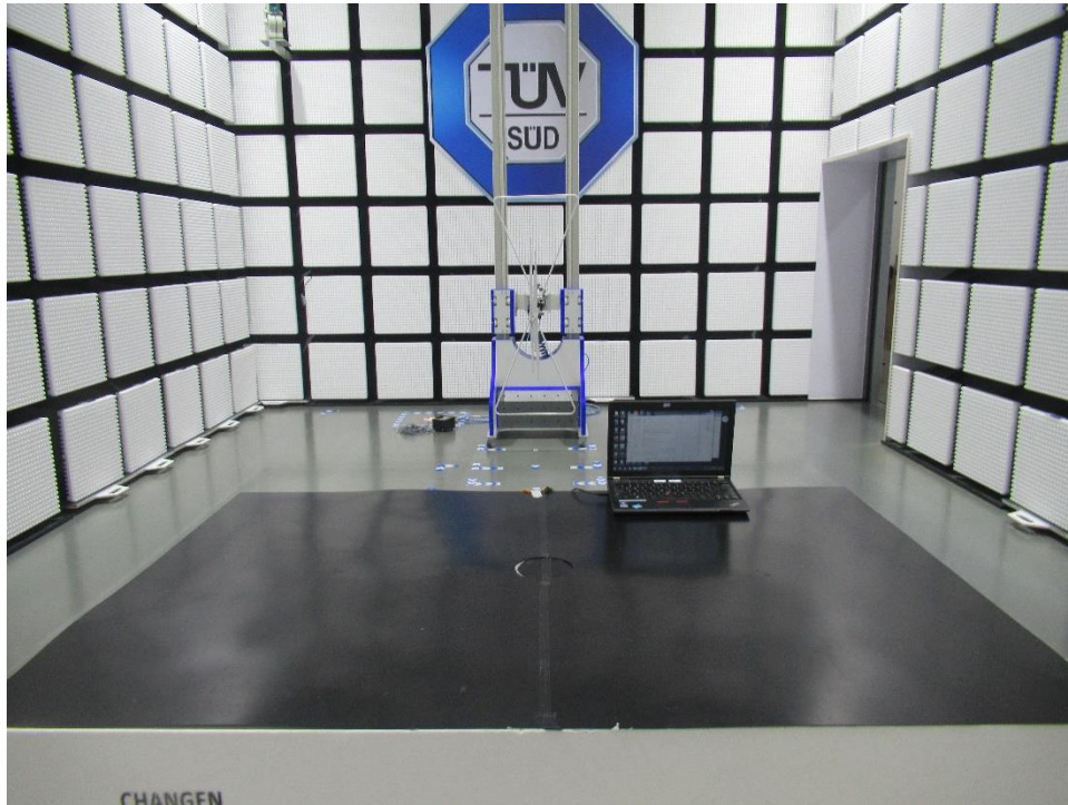
Radiated spurious emission 30MHz-1GHz