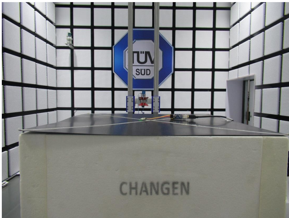
Radiated spurious emission 1GHz-18GHz