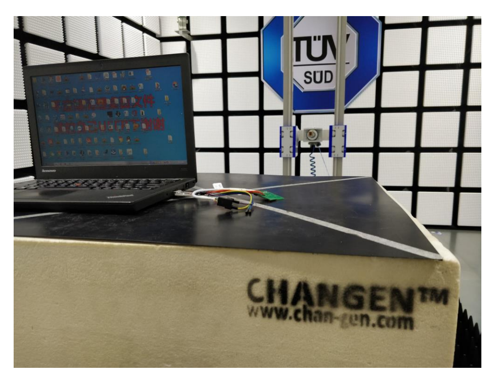
Spurious emission 18GHz - 40GHz