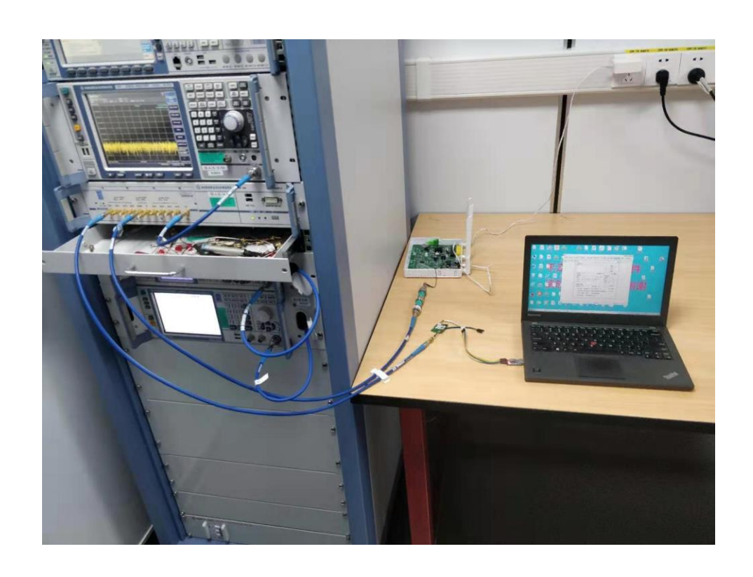
DFS Test Photo