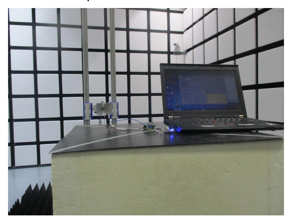
Spurious emission 1GHz - 18GHz