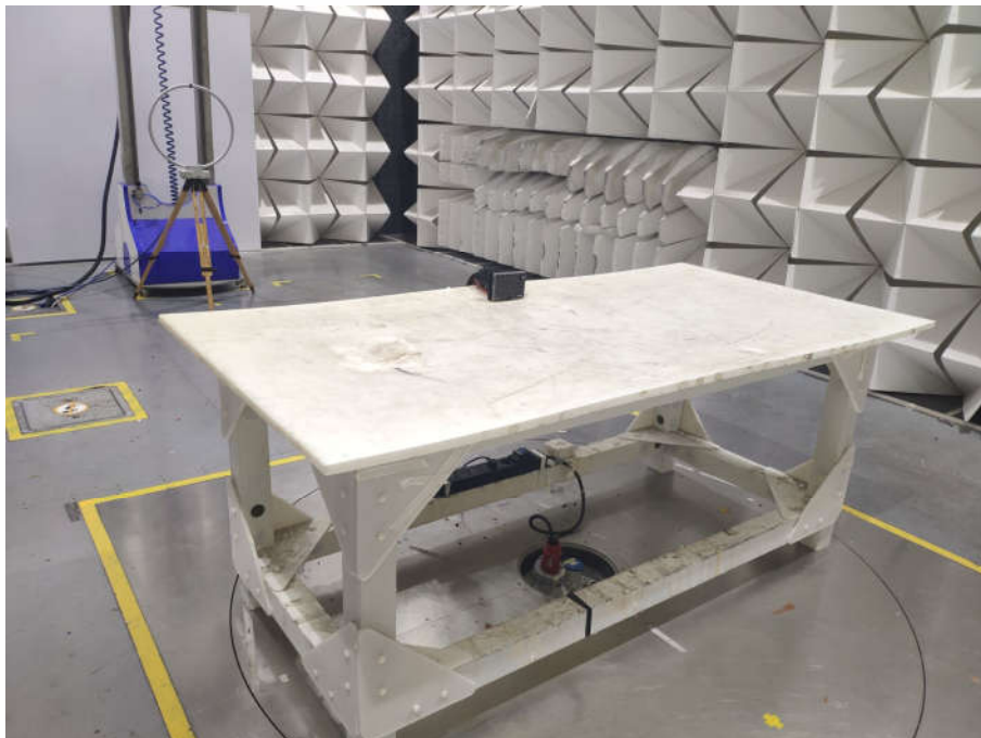
Radiated spurious emission Test Setup-1(Below 30MHz)