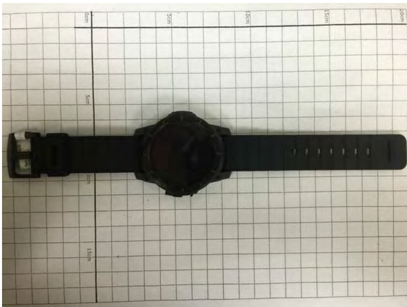
Fig.4 Front view of EUT