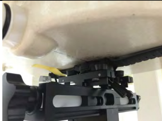
Fig.3 EUT Back side to flat phantom