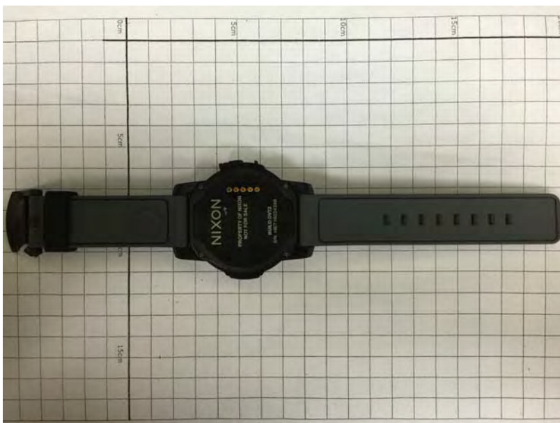
Fig.5 Back view of EUT