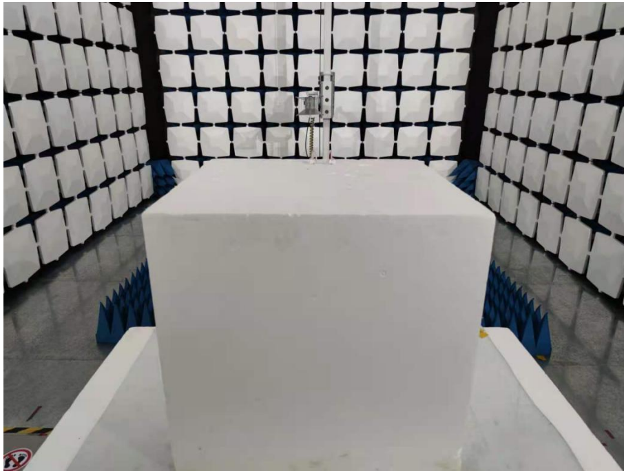
Blow 1GHz for radiated emission test setup