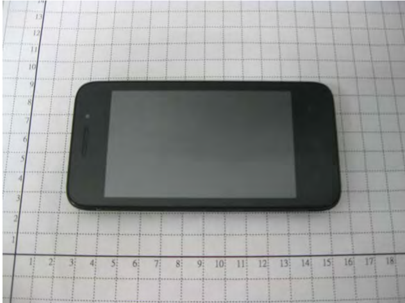
Fig. 3 Front view of EUT