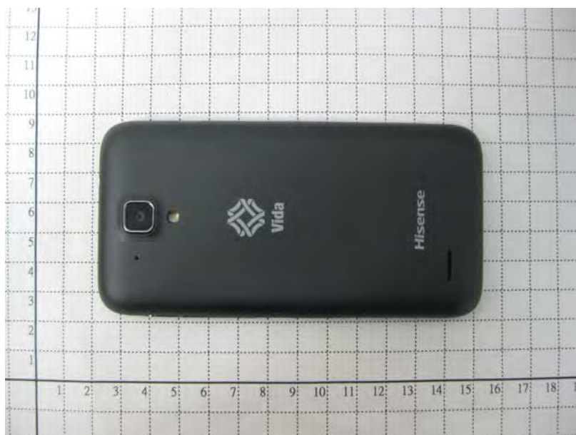
Fig. 4 Back view of EUT