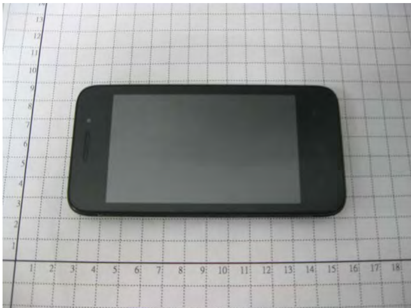
Fig. 3 Front view of EUT